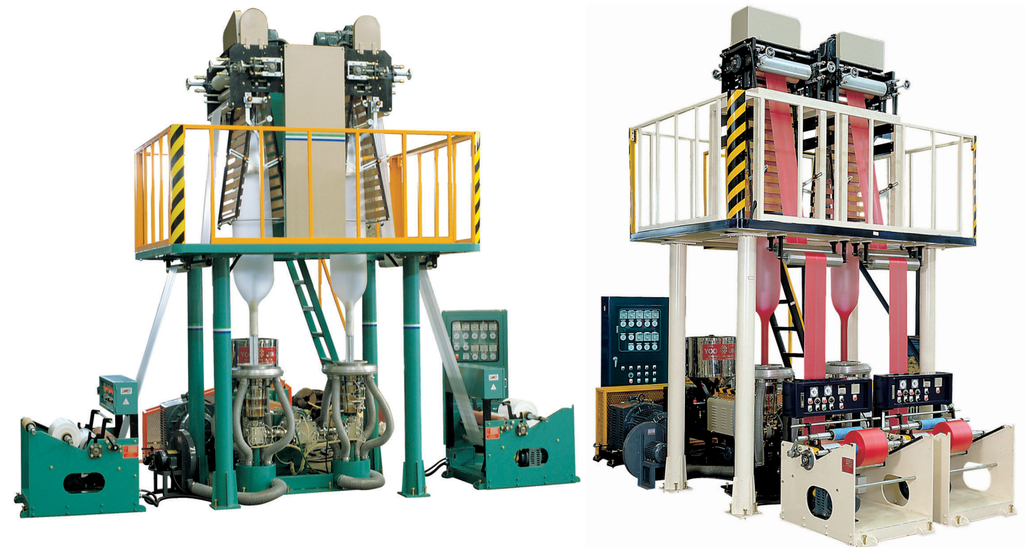
YJFD - Ø60 / 600L (B TYPE)