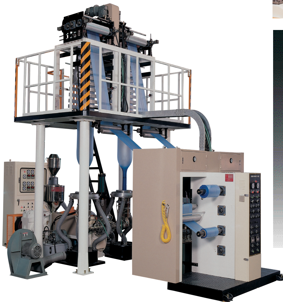
YJFD - Ø60 / 600L (A TYPE)